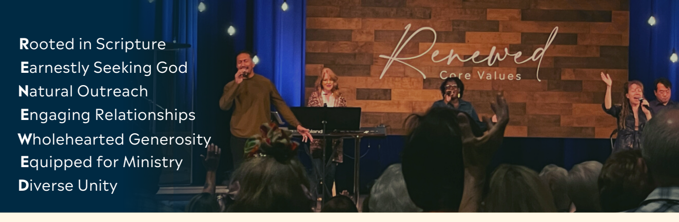
MAY 21, 2023 | 9:30 AM WORSHIP

Communities renewed through the love of Jesus.