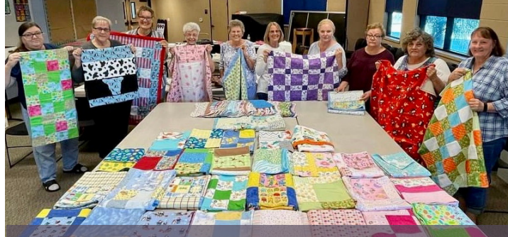
In November, Piecemakers donated handmade quilts to Choices and Assure womens clinics.