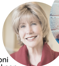
Joni Earekson Tada