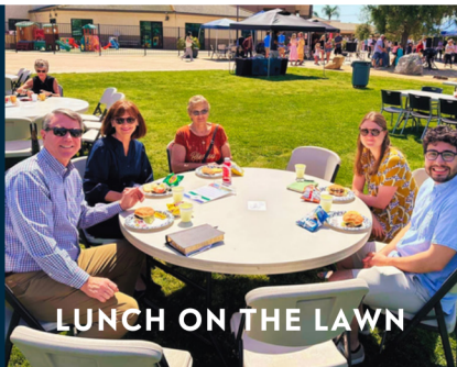
LUNCH ON THE LAWN